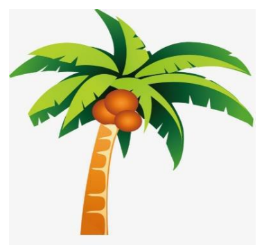
Guava tree, height = 5478106 cmCoconut tree height =9989235 cm